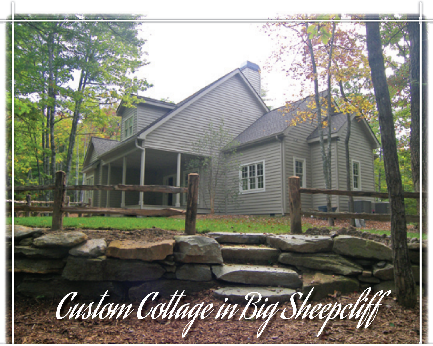
Custom Cottage in Big Sheepcliff