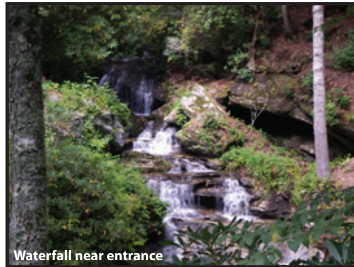
Waterfall near entrance