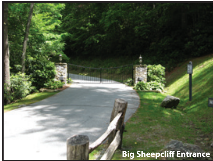
Big Sheepcliff Entrance