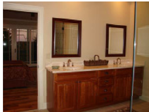
Luxurious Master Bath