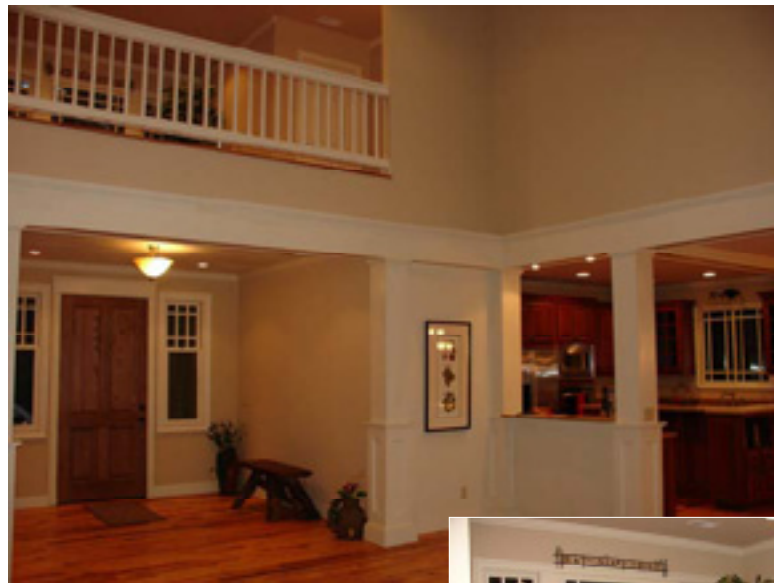
Open Living Areas & Upper Level Loft