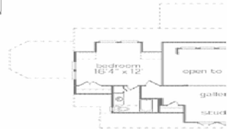
Upper Level Floor Plan

Floor plans are not to scale & room sizes are approximate. Price & floor plans subject to change without notice.